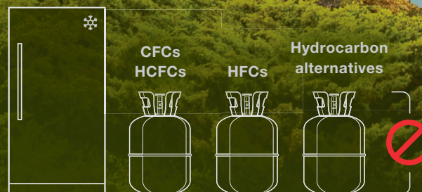
Other suppliers' refrigerators and freezers